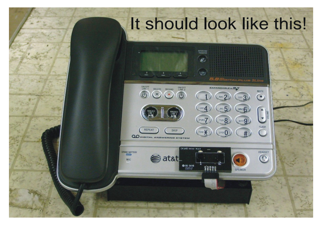
6- Connect the POWER CUBE from the CK-1 box to 115VAC power. That's it!