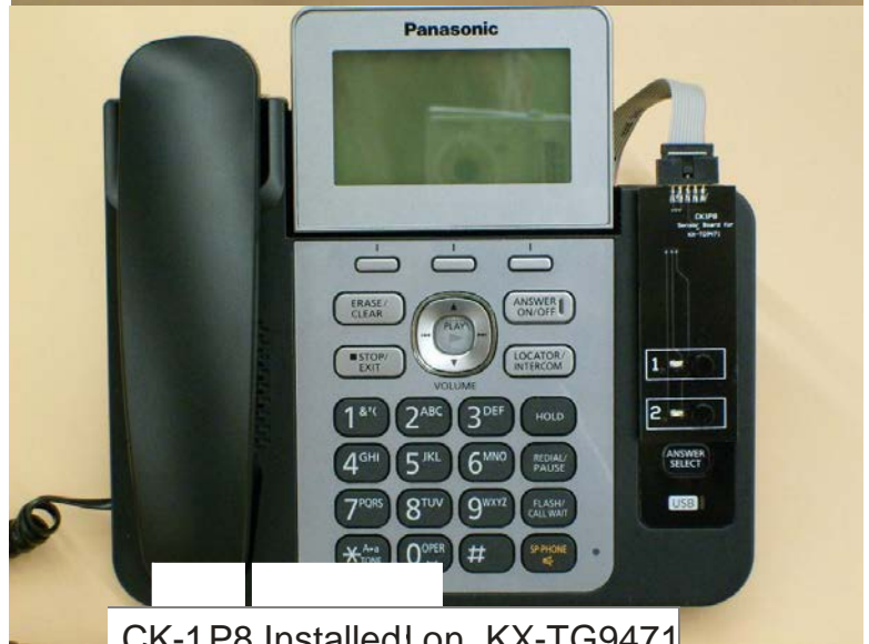
CK-1P8 Installed on KX-TG9471