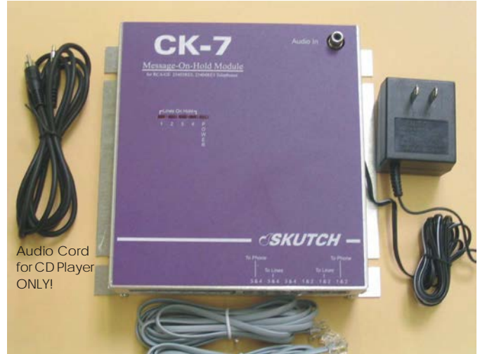
Audio Cord for CD Player ONLY!

Thank you for purchasing the Skutch CK-7 Promotion-On-Hold Module for the RCA 25403, 25404, 25413, 25414 and 25415 four line telephones. The CK-7 supplies Telephone On Hold music on hold audio whenever any call is placed ON HOLD with the telephone's hold button. The CK-7 can be installed on any one of the compatible telephones and is accessible from all compatible telephones that are connected to the same telephone lines. Other makes and/or models of telephones can be used with the CK-7 but they will not produce music on hold audio when placed ON HOLD.